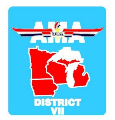
An AMA Gold Leader Club Charter # 368 Since 1953