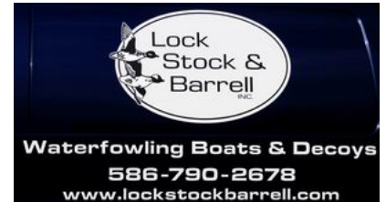
FME A ..... CATALOG