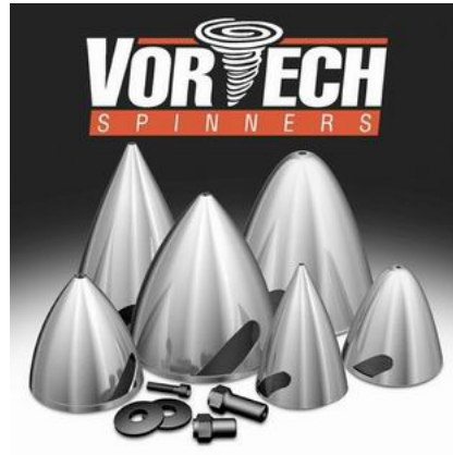
P&D Hobby Shop